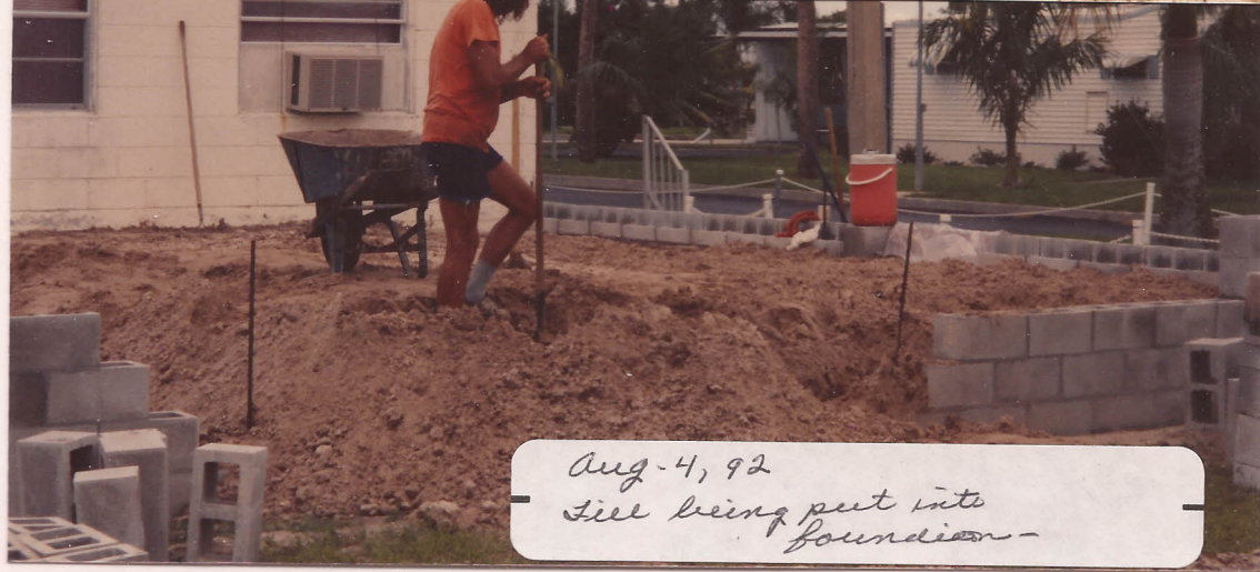
Aug-4, 92 Fill being put into foundation -