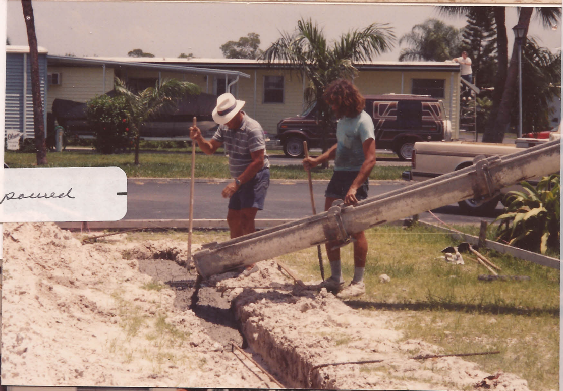
July 28, '92 Footings being poured