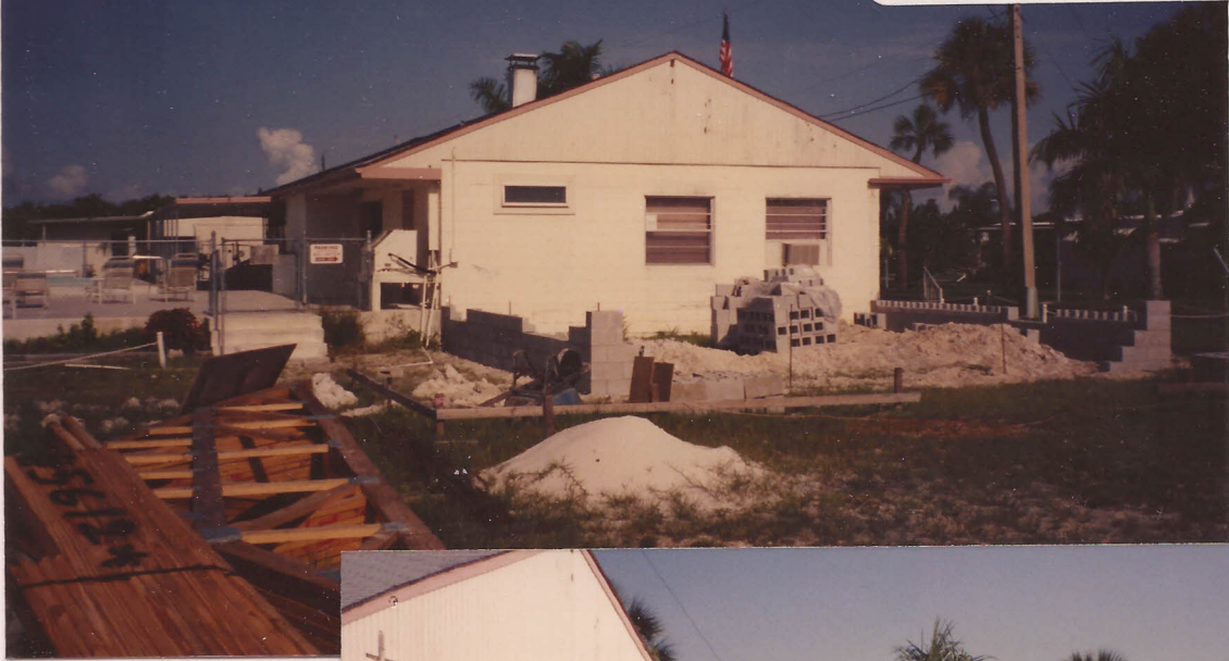
8-1-92 East End of addition