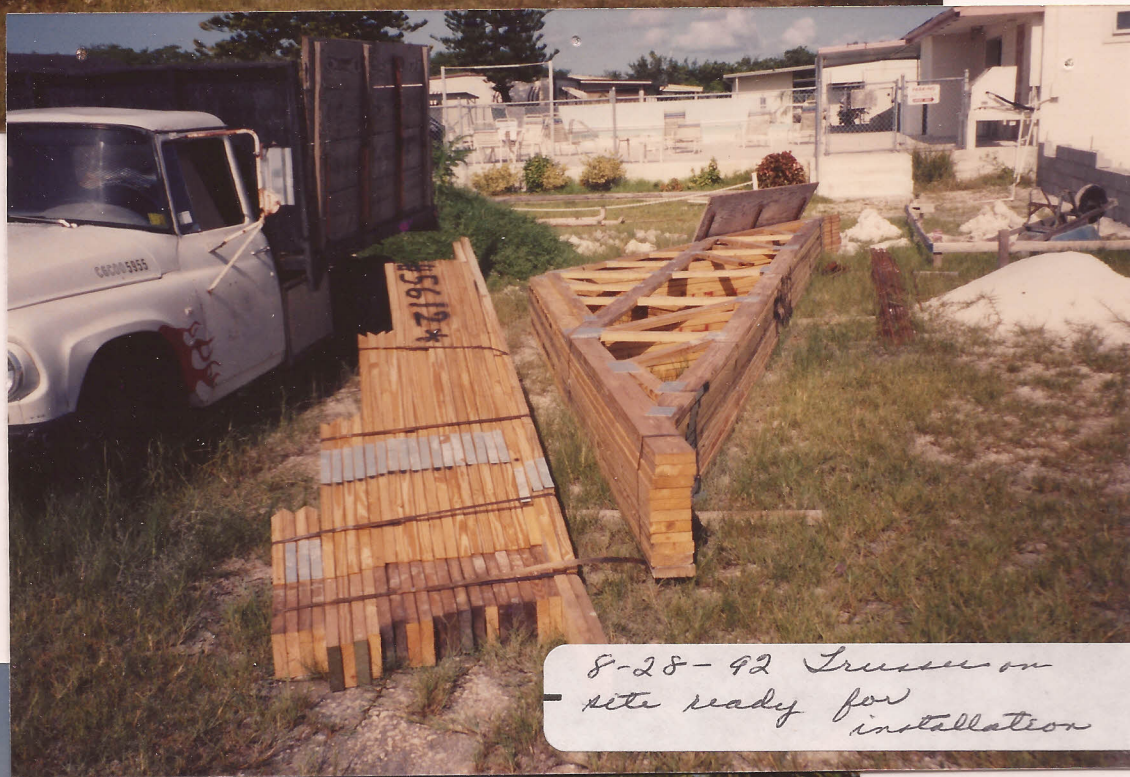
8-28-92 Trusses on site ready for installation