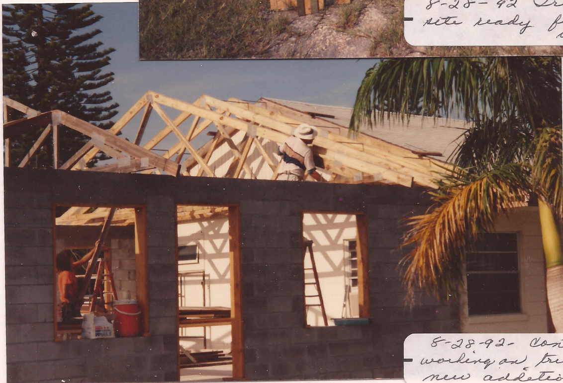
8-28-92 Contractor working on trusses for new addition