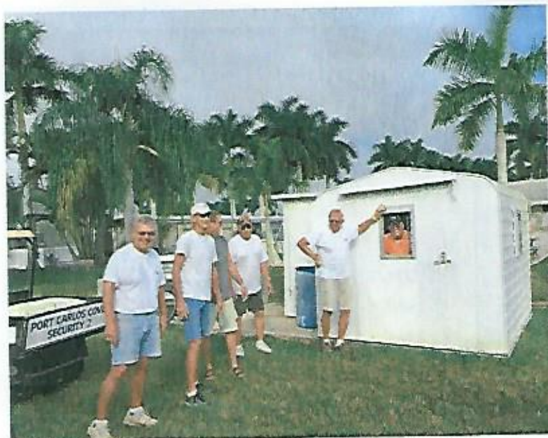
Members of the Men's Club installing the new shed.