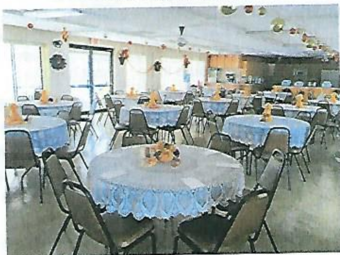
PCC THANKSGIVING TABLES